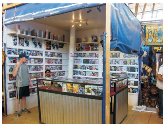
Stall raided at Chameleon Village Flea Market

Whilst actions against flea market stalls is 236% up on the 1st Quarter of 2007 the number of actions is in line with those in the last three quarters of 2007 and reflects the ongoing suppression of pirate activities at former hot spots, such as Blue lagoon in Durban, Chameleon Village and Montana Traders Square in Pretoria.