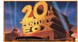
20th Century Fox