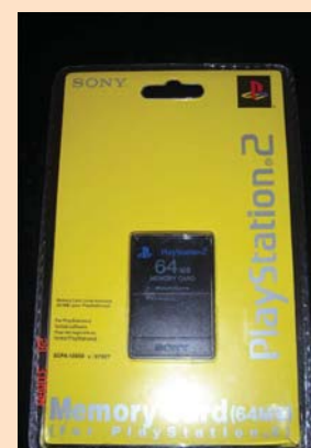
Counterfeit 64 megabyte memory card seized by Customs in Port Elizabeth

Counterfeit memory cards still being found but in substantially lower numbers than before. 16, 32 and recently 64 megabyte memory cards in PlayStation packaging have been intercepted by Customs but in much lower numbers than previously experienced.