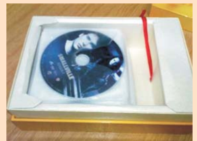
Imported copyright infringing box sets of TV series now common in South Africa