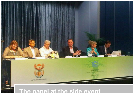
The panel at the side event

The panel discussed issues around establishing the right framework for encouraging financing and investment, including what is the role of market based instrument, fiscal policy, and what can the UNFCCC do to redirect existing, and channel new, flows of finance towards green investments.